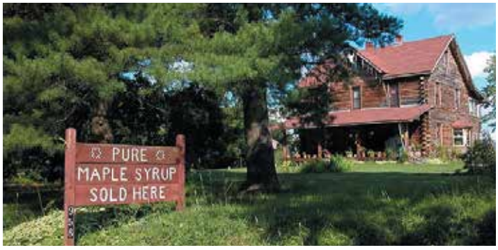
Kinzua Bridge Scenic Byway, State Route 3011, Pennsylvania's FIRST Scenic Byway

In the Allegheny National Forest the sky is more vast, the mountains higher, the trees a bit taller. McKean County is known as Trail Central because of the over 600 miles of year-round multi-use trails. If you can dream it you can do it here. Cruise the Longhouse National Scenic Byway, the Kinzua Bridge Scenic Byway and Pennsylvania Route 6 to get into the heart and soul of America.