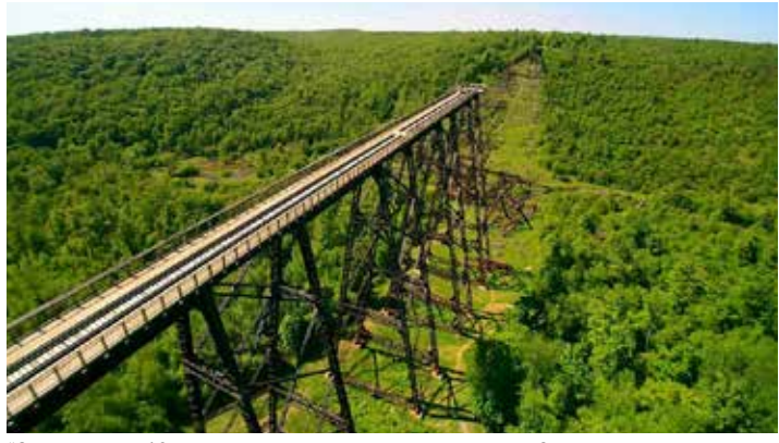
"One of the top 10 most scenic skywalks in the world," The Culture Trip, U.K.

Fall Foliage Peeks Early. Here in the upper elevations of the Alleghenies, prime "leaf peeping" is late September and the first two weeks of October. Travel Savvy magazine named the Longhouse National Scenic Byway, in the Allegheny National Forest, as one of the top six fall foliage drives in the United States. Fall really is bigger here!